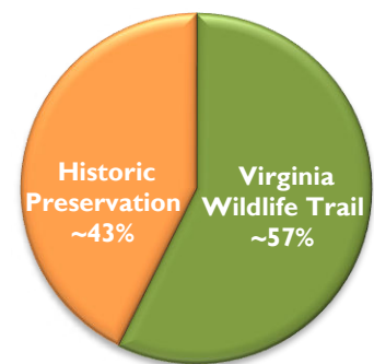
*Project investment breakdown

To contribute to the impact of Maymont 2025, or for more information about the project, please visit maymont.org/maymont-2025 .